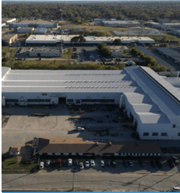
Fort Worth Facility

Multiple Facilities Supporting Utility Projects at Scale